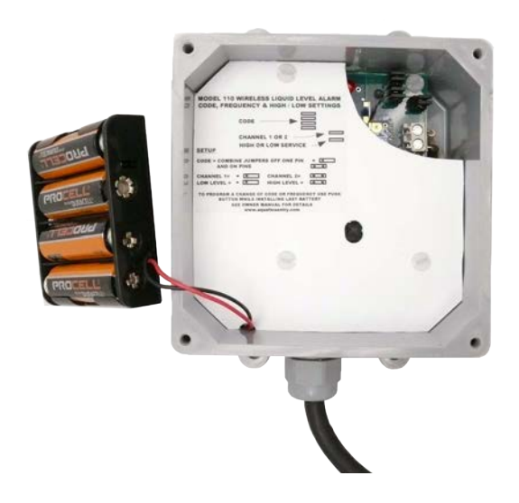
FIG 2 Outdoor Transmitter Enclosure Interior