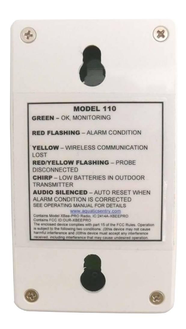
FIG 6 Indoor Alarm Display Rear Operating Instructions