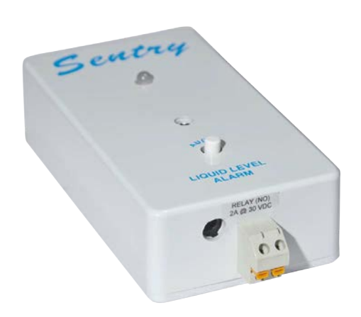
FIG 5 Optional Relay Output