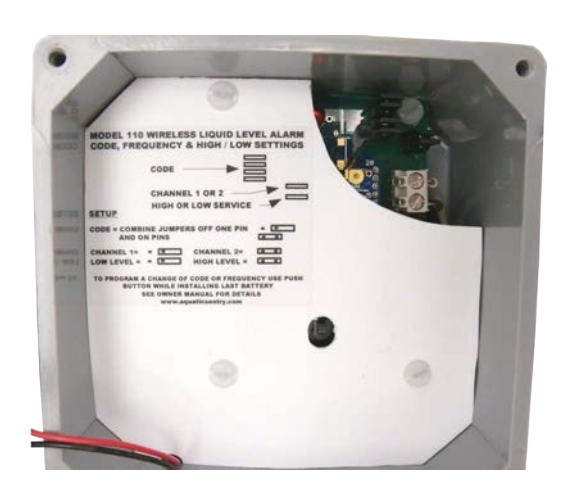
FIG 3 Outdoor Transmitter Enclosure Interior Close-up