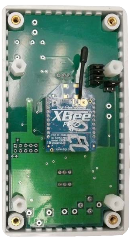
FIG 1 Indoor Alarm Display Interior