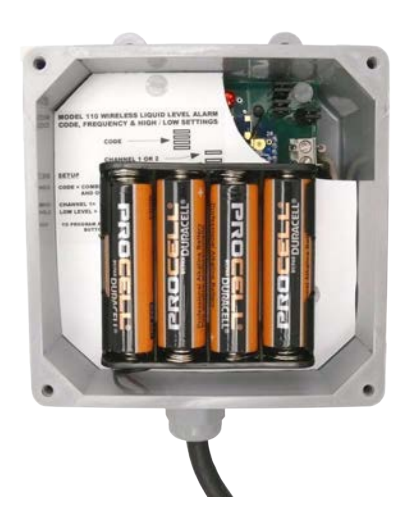
FIG 4 Outdoor Transmitter Batteries Installed